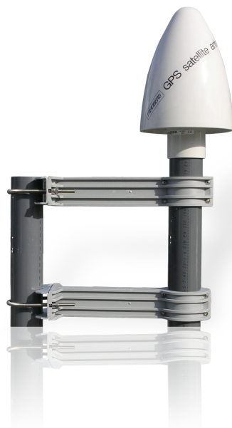
GPS Antenna/Converter Unit with mounting kit