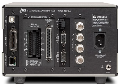
PPM100 rear panel

An embedded web server connects the PPM100 to the world wide web (password protected). The EWS can deliver measurement data to any standard internet browser. Use the EWS to monitor and control your vacuum system or to get automatic email notification of potential or real system problems.