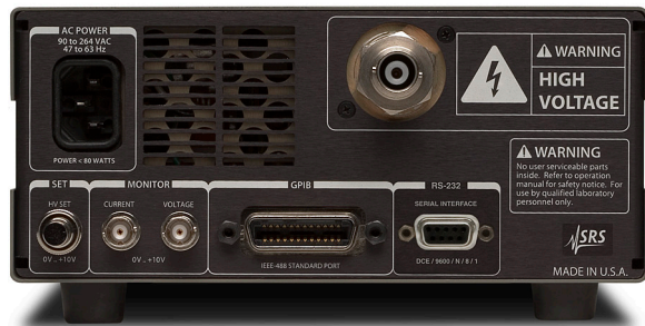
PS370 rear panel

Both GPIB and RS-232 computer interfaces are standard on all 10 W supplies. GPIB is available as an option on the 25 W instruments. All parameters can be set and read via the computer interfaces.