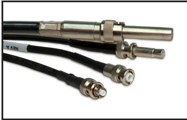
High voltage cables

Operation is simple. The parameter being adjusted or set is displayed separately and can be entered without affecting the actual output voltage. Up to nine instrument configurations can be stored and recalled at any time, making it easy to run multiple tests.