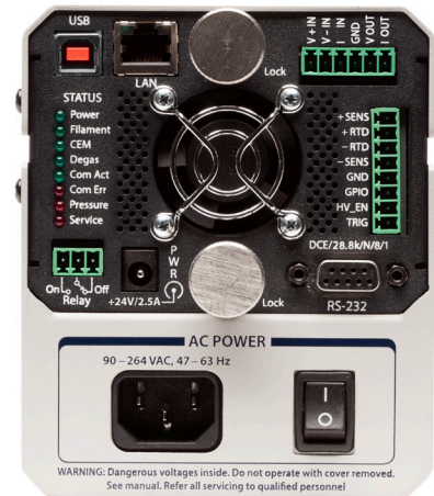
RGA120 rear panel (with optional AC power module)

The new RGA120 series is ideal for applications involving gas analysis, leak detection, and vacuum processing. We offer 120, 220 and 320 amu systems with supporting Windows software, and options that include an electron multiplier and a built-in power module for AC line operation. The RGA Windows software is downloadable from SRS website.