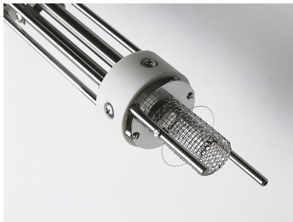
Dual \text{ThO}_2/\text{Ir} filament

A long-life, dual thoriated-iridium ( \text{ThO}_2/\text{Ir} ) filament is used for electron emission. Dual \text{ThO}_2/\text{Ir} filaments last much