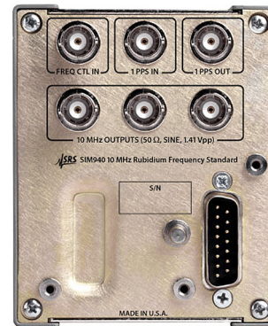
SIM940 rear panel