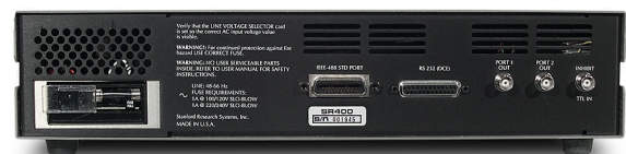
SR400 rear panel