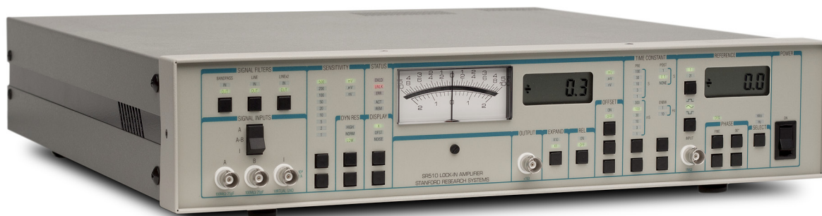
SR510 Lock-In Amplifier

An optional internal voltage-controlled oscillator provides both an adjustable-amplitude sine wave output and a synchronous, fixed-amplitude reference output. The sine wave amplitude can be set to 0.01, 0.1 or 1 V rms , and can drive up to 20 mA. The oscillator frequency is controlled by a rear-panel voltage input and can be adjusted between 1 Hz and 100 kHz. Typically, the sine wave output is used to excite some aspect of an experiment, while the reference output provides a frequency reference to the lock-in.