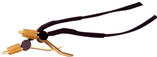
SR726 Kelvin Clips

The SR715 and SR720 support three types of binning schemes: pass/fail, overlapping and sequential. Pass/fail has only two bins: good parts and everything else. Overlapping (or nested) bins have one nominal value and are sorted into